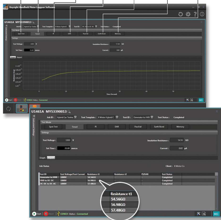
Job Status Reporting View

Spot Test Timed Test PI Test DAR Test Pass Fail Earth Bond Memory