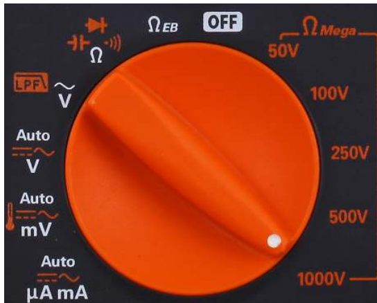
Figure 6. Insulation resistance tester with full featured DMM