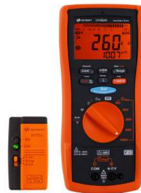
Figure 4. U1117A IR-to-Bluetooth Adapter enables wireless remote testings with the U1450A/U1460A series