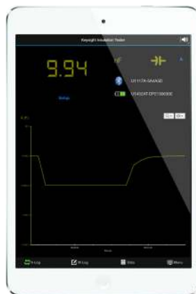
Figure 3. Data logging interface on Keysight Insulation Tester Application