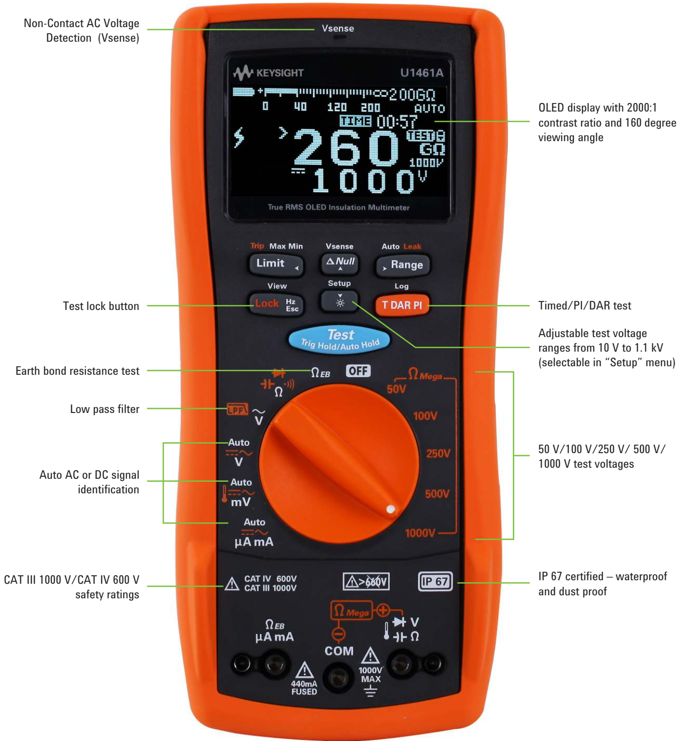
OLED front panel