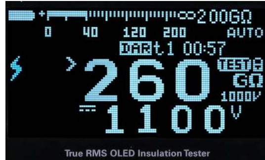
Figure 5. Adjustable insulation test voltage up to 1.1 kV

The adjustable insulation test voltage from 10 V to 1.1 kV in 1 V steps on selected two models 1 allows you to set precise test voltages catered to unique test application requirements. These typical applications are commercial avionics testing, military communications system testing and production line testing. The standard test voltages from 50 V to 1 kV is also available for selected models 2 .